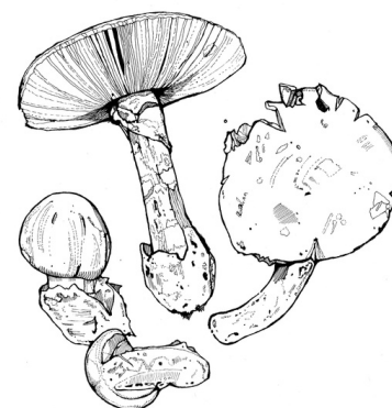
amanita basii